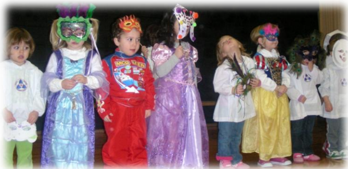
Scuola children celebrating "Carnevale"

Lo Staff della Scuola Materna vuole ricordare ai genitori che i bambini ai primi sintomi di influenza dovrebbero essere controllati e curati, e al limite tenuti a casa in modo che l'infezione e il contagio abbiano fatto il corso e si è in fase di guarigione ; si consiglia di riguardare accuratamente il "Parents Manual" alla voce Health Regulations ".