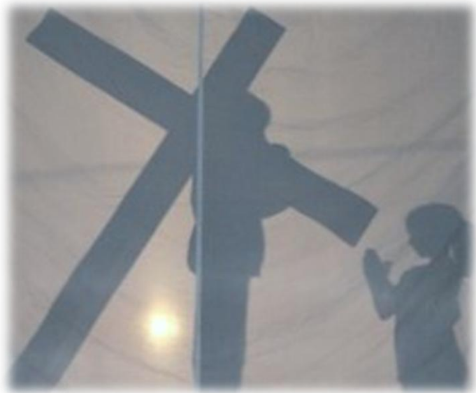
A scene from the "Stations of the Cross" ceremony

On April 5, Holy Thursday, the school celebrated the upcoming Easter Holidays with a special “ Stations of the Cross ” assembly. Parents were invited to join us in the celebration which was held in the school gym at 3 pm.