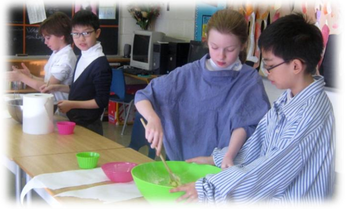
Above: Grades 4/5 students making biscotti