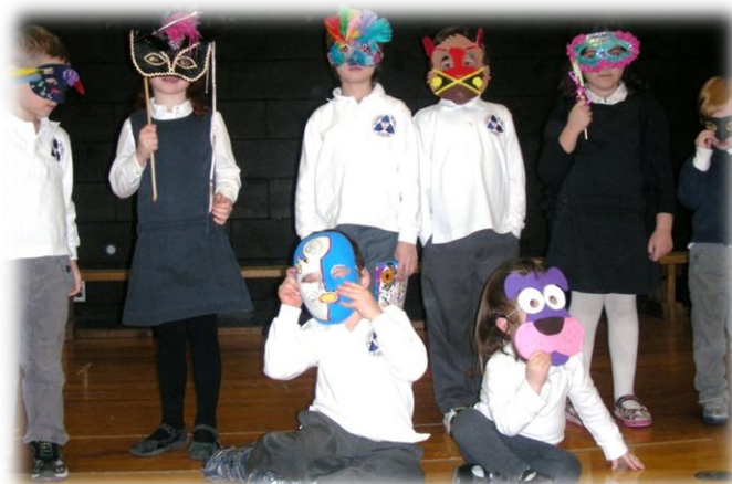
Casa children in their "Carnevale" masks

As we move to Spring time, the children continue to work hard in the classrooms. Many have become accustomed to our routine, and are now able to fully immerse themselves in their work. The children continue to show an enthusiasm for school and learning that is unprecedented. We want to thank the parents for always trying their hardest to follow our guidelines in terms of punctuality, dress code as well as nut restrictions in any food item brought to school. For the children still learning bathroom routines, we remind parents to please provide an extra pair of shoes, and several clothes changes to be kept at school.